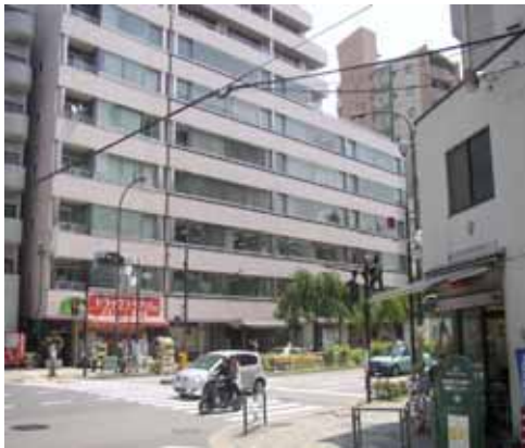
IES office, Shibuya

IES management has been guided since its beginning by both Japanese and Western management policies and practices. IES management makes a continuing effort to provide a supportive workplace that considers the welfare of its employees and students in a complex multi-cultural environment. Feedback from employees and students is encouraged so that problems, whenever they are identified, can be reviewed and resolved.