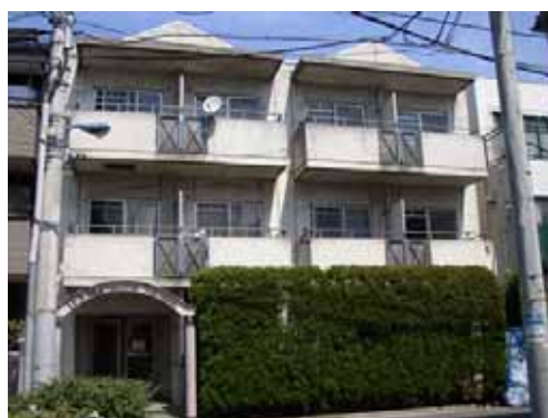
IES Instructor Apartments, Tokyo

Our coordinator will help you find an economical, conveniently-located apartment and IES will provide the necessary guarantorship. You will be responsible for securing and paying for airfare to Japan, your moving-in costs, furnishing your apartment, monthly rent, the security deposit to the owner, utilities and the payment to the real estate agent.