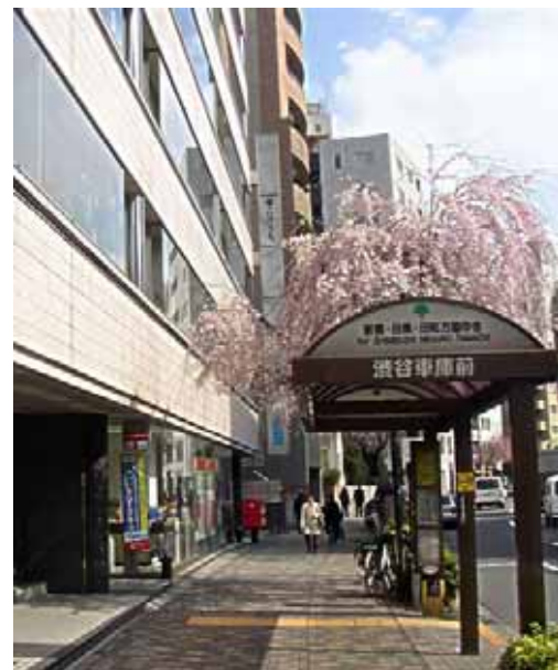
IES office, Shibuya

Many of the texts and various learning materials that are used in our classrooms have been developed by our instructors. We also use texts and learning materials from leading publishers. In addition to our own learning materials, we develop customized texts on requests from clients.